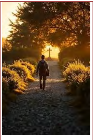
Follow Jesus. He's already been where you are going, and He knows the way home.